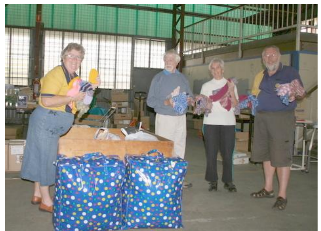
Knitted Goodies from the Gowards