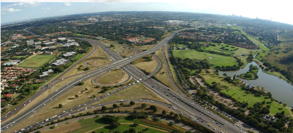
City Road infrastructure

PO Box 1579 PARKLANDS 2121 RSA Tel/Fax +27 11 883 9718 Chartered April 21, 1921, District 9300 PBO 18/11/13/2193 Club Meeting: Tuesdays 12h30-14h00 at the Country Club of Johannesburg, Auckland Park