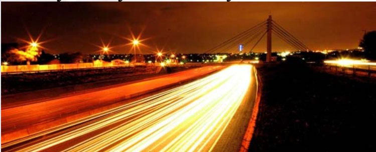
Nelson Mandela bridge silhouette

We at the Rotary Club of Johannesburg particularly look forward to this sports spectacular as we believe it will bring many of our Rotarian friends to the country and possibly to Johannesburg. Our club was the first one established on the African continent. We will holding our meetings in the vibrant heart of Johannesburg during this period and hope to introduce you to a taste of a first world yet truly African city!